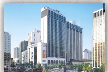
Take a taxi and get off at the Lotte Hotel Seoul.