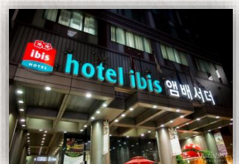
Get off at Ibis Ambassador Myeongdong across from Lotte Hotel Seoul.