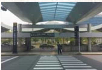
Get out through the Gate 1 or 2.

You may take a taxi to get to the Lotte Hotel Seoul. ( Sogong-dong, Jung-gu ) The ride will cost you approximately KRW 25,000 and the journey will take about 40~50 minutes .