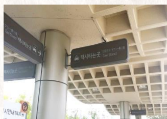
Cross the road to take a taxi.