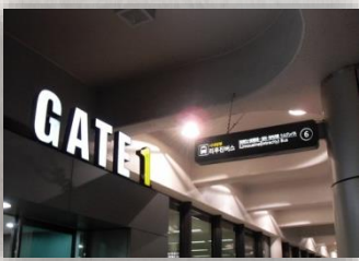
Exit via Gate 1.