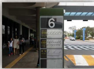
Get on no. 6001 bus At bus stop 6 and pay the fare (KRW 7,000) upon getting aboard cash only.